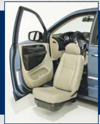
VALET® SIGNATURE SEATING