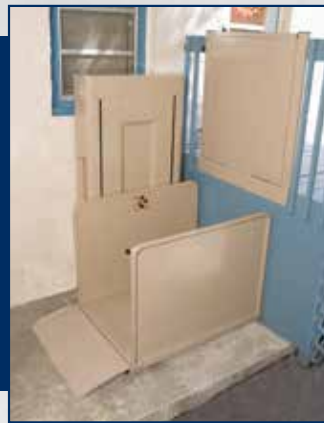
VERTICAL PLATFORM LIFT Model VPL-3100