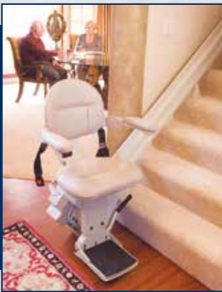
ELITE STAIRLIFT Model SRE-2010

Home accessibility solutions and automotive products